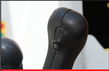
2-Speed Travel w/ Auto Shift