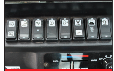
Multi-Function Switch Bank

Delivering outstanding performance and versatility, the TB240 is one of Takeuchi's most popular conventional tail swing excavators. The TB240 offers steel construction and lockable service access panels, an automotive styled interior, and a smooth and powerful hydraulic system. The TB240 has excellent breakout force, reach and lifting capacity for maximum productivity making it a great choice for the most demanding applications.