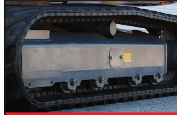
Triple Flanged Track Rollers