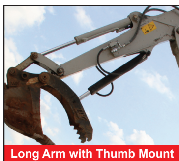
Long Arm with Thumb Mount