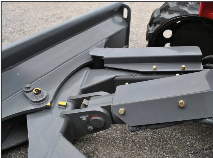
Angle Blade with Reversible Bolt On Cutting Edge