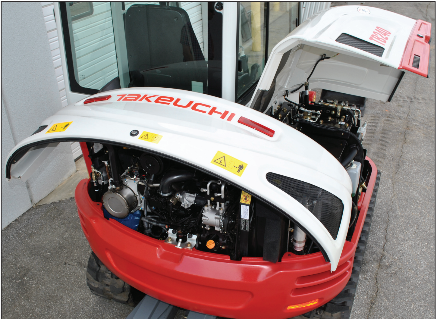
Large lockable service hoods provide vandalism protection and outstanding maintenance access.

Additional features include a DOC + DPF exhaust after treatment system, automatic idle, heavy duty cooling module, and a large wraparound counterweight that protects engine components from damage. The interior offers excellent operator comfort with pilot operated controls, travel controls with large foot pedals, foot operated boom swing, easy to reach rocker switches and a dial throttle control.