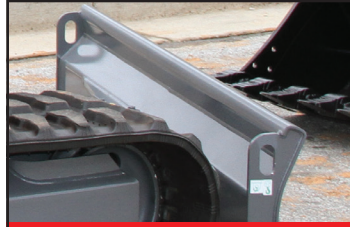
Integrated Anchor Points